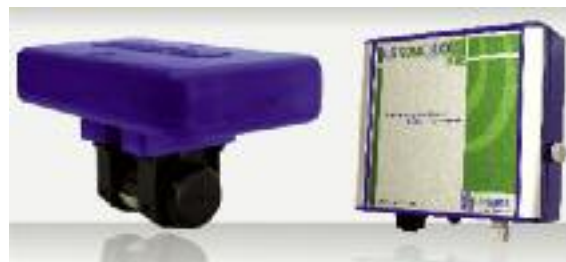
LG Sonic system.

To obtain the successful treatment of the water, one should first know that no water body is the same – every water body is unique and should be